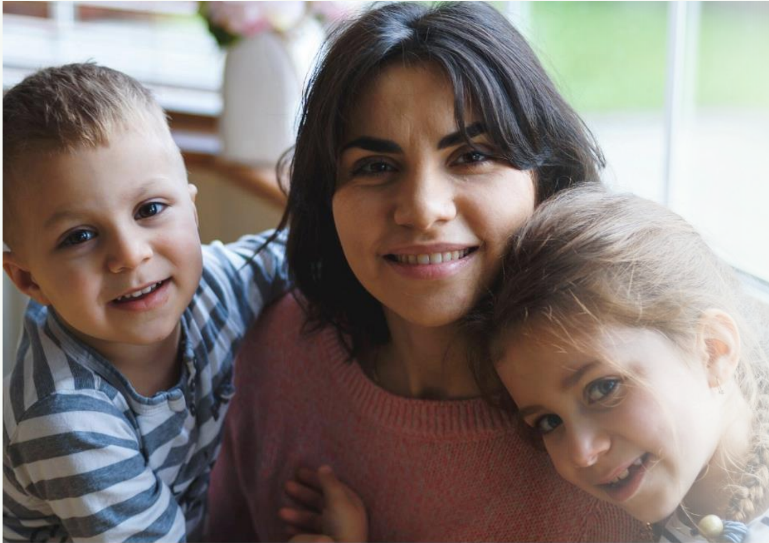
From Intouch Multicultural Centre Against Family Violence