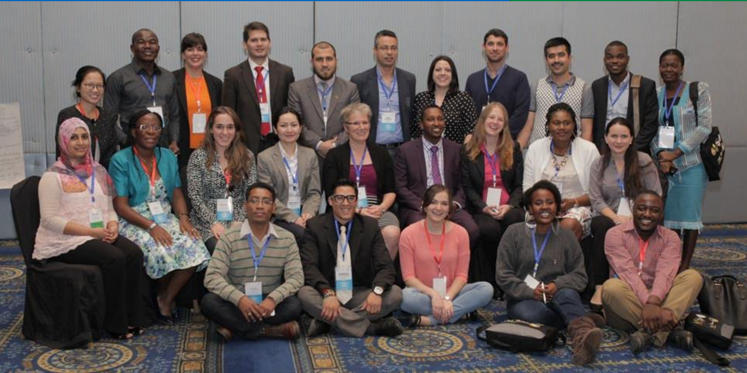
EvalYouth Launch (Nov 2015) at the EvalPartner's 2nd Global Evaluation Forum, Kathmandu. 23 Founding members.