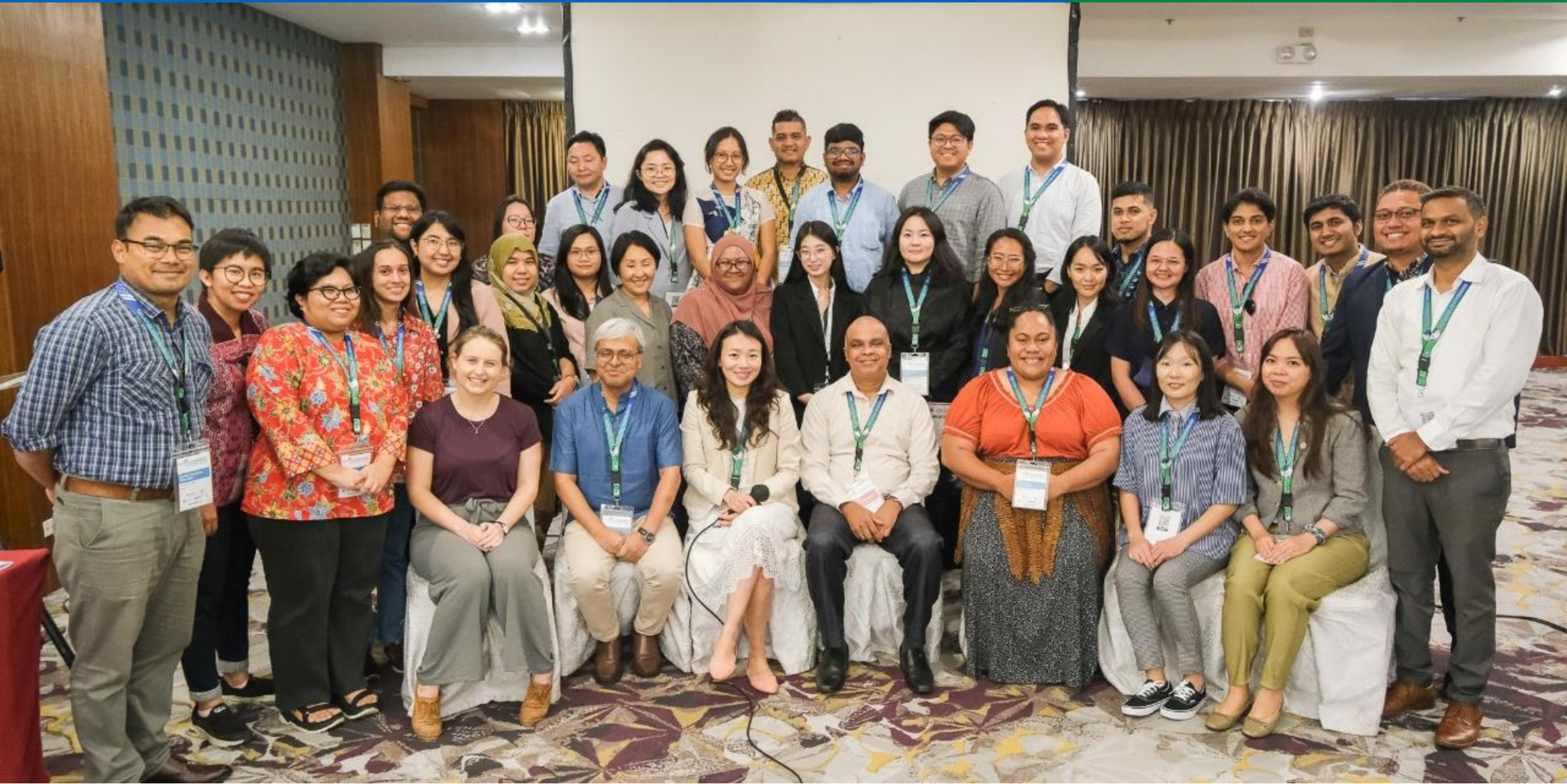
4th Asia Pacific Winter School 2023 in Manila. 28 participants from 12 countries