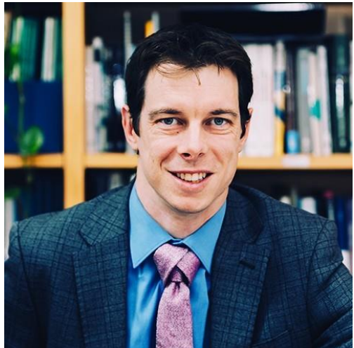
Director, ARTD Consultants