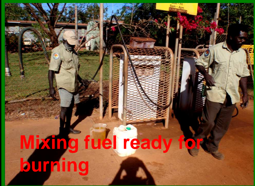
Mixing fuel ready for burning