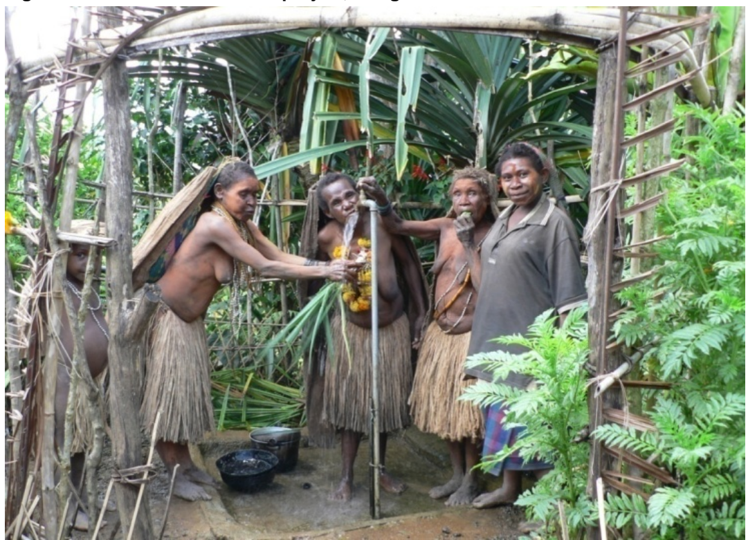
Figure 1. APNGIF funded water project, Bougainville.

These underlying assumptions were examined during the APNGIF support evaluation for validity.