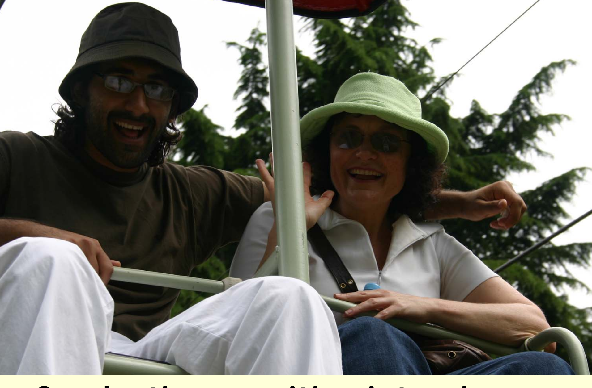
Conducting cognitive interviews